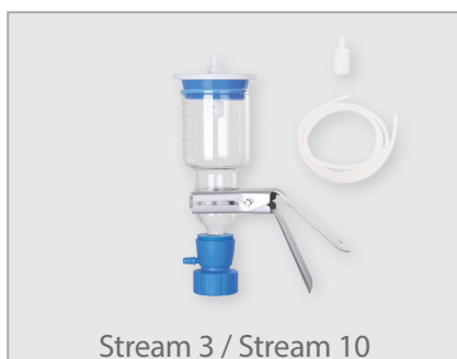
Stream 3 / Stream 10