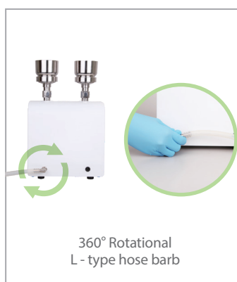
360° Rotational L - type hose barb