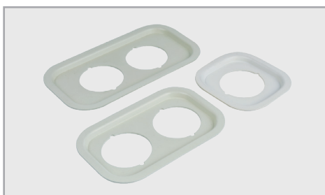
Beaker positioning cover Used to position beaker for indirect cleaning (Optional accessory)