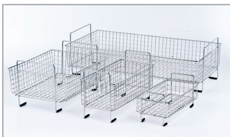
Basket Ideal for small parts (Optional accessory)