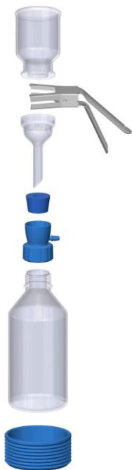
VF12 filtration set

Combination of Lafil 300C-VF12 Vacuum Filtration System