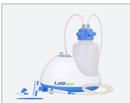
Lafil 200 Plus