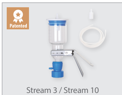
Stream 3 / Stream 10