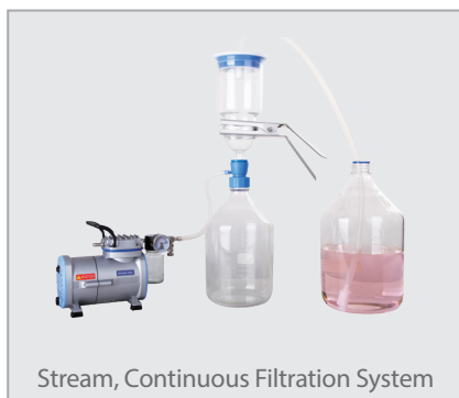
Stream, Continuous Filtration System