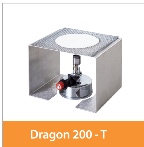
Dragon 200 - T